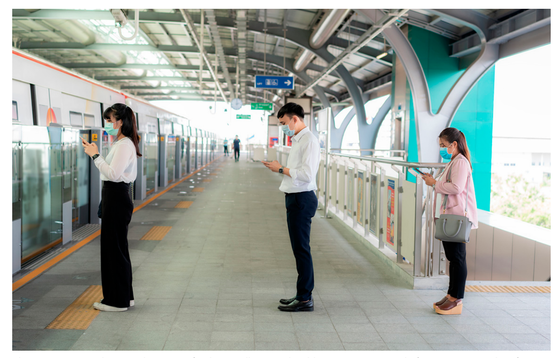
Chaotic systems such as pandemics are fundamentally unpredictable. A constructive role for science is to identify interventions—including social distancing, mask wearing, policies of isolation, and travel restrictions—that will help the number of active infections to decline exponentially.

Carefully delineating models' strengths and shortcomings will not only clarify how they can help but also temper expectations among policymakers and members of the public looking to understand the full impact of the virus in the weeks and months ahead. More important even than prediction is the ability of models to guide actions that can change this impact, including actions that can potentially drive the virus to extinction.